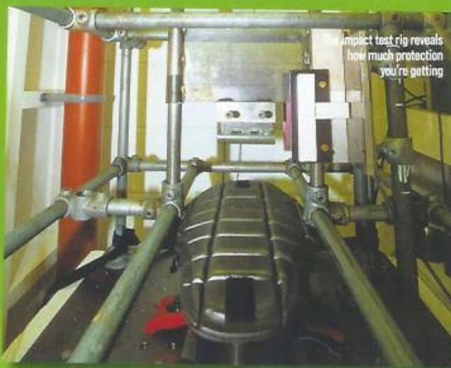
The impact test rig reveals how much protection you're getting

Each protector was worn for hundreds of miles to assess comfort, fit and how easy they are to get on and off etc. To make sure they're a practical year-round proposition, we checked if they were OK under a winter jacket too.